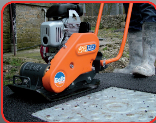
Ideal for 'Patching'